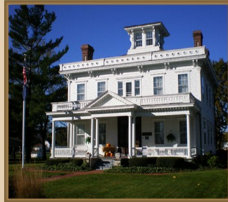
The Anson Wolcott house, in Wolcott, Indiana. Construction began in 1859 and it was completed after the Civil War.